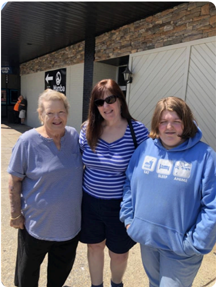
I loved you so! Only met you a few times and we bonded immediately. Hanging with you at church,...